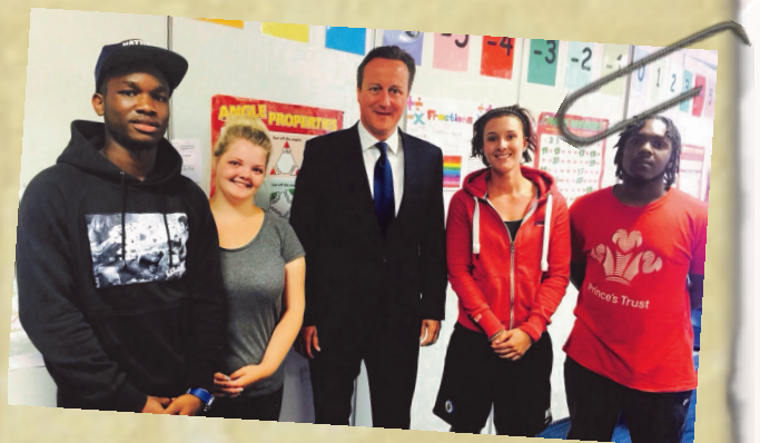
Above : Me meeting David Cameron with KIKIT and the Princes Trust.

However since being referred to KIKIT I have had confidence in speaking to the mentors about my life, thoughts and also opinions. Also having being on the Princes Trust course I have a lot of motivation from KIKIT and I am proud to say I have found some happiness with my life because I know my future is going to be great for me. KIKIT was a new place for me where I didn't think I'd meet new friends but I am glad to say that they have supported me all the way through my course and I am looking to start a job at Auto scan in a month's time."