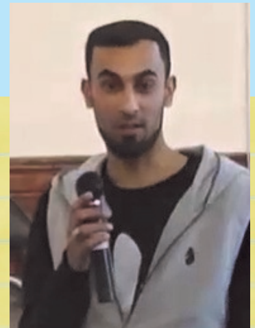
Above : Me telling my story at a KIKIT community event.